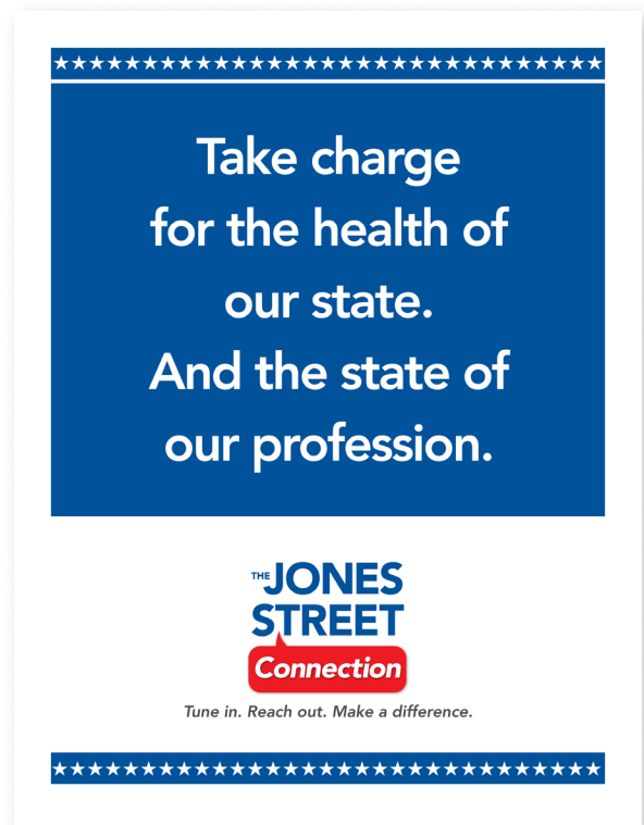
View more North Carolina Dental Society samples