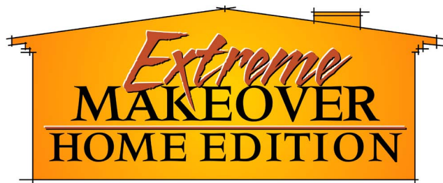
View the Extreme Makeover Home Edition case study